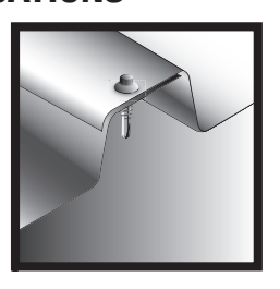
FOR PROPER APPLICATION, THE USE OF IMPACT DRIVERS ARE NOT RECOMMENDED FOR POWDER COATED OR ANY WET PAINTED FASTENER