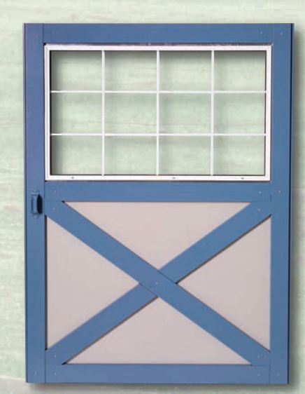
Arcadian Slider Half Light