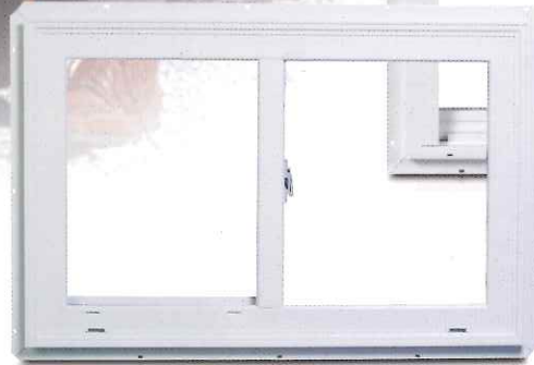
900 SV Horizontal Slider